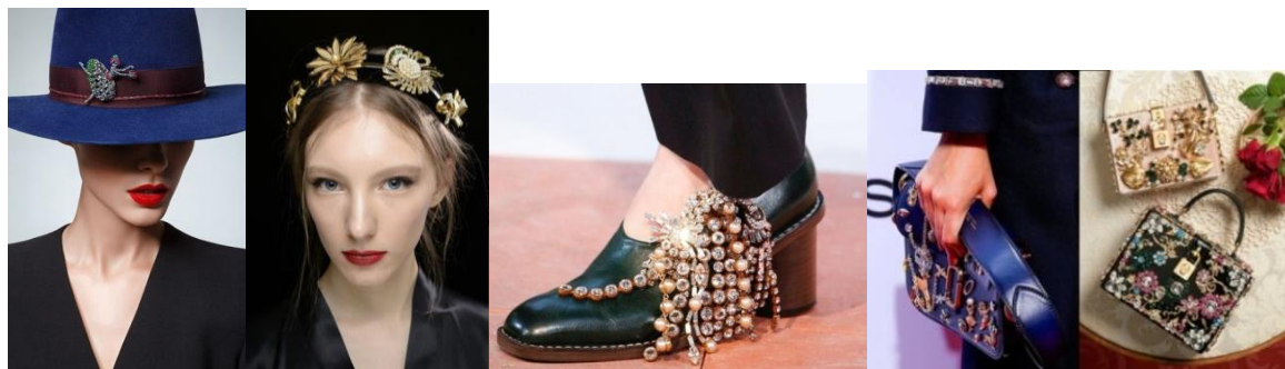
Figure 6. The examples of wearing of brooches

look very elegant on the edge of the collar [16]. On headwear, the brooch can decorate hat, mini hat, fur hat, beret, woolly cap, turban and even headband. In this way, it is possible to create any image and own style. Fashion designers suggest wearing brooches on shoes and bags in the coming season (Figure 6).