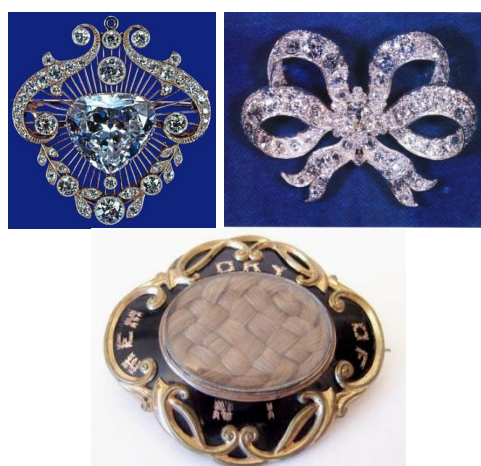
Figure 2. The example of an agrafe brooches

pins on the clothes that fastened the collar of undershirt, or simply were put on for decorative purposes – came into fashion. More precious stones appeared on the adornments of the Middle Ages, as well as more complex images: the scenes of spiritual and religious content, animalistic images, as well as inscriptions, emblems and mottoes (Figure 2).