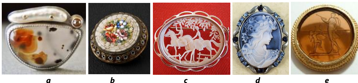
Figure 5. The examples of brooches made with the use of mechanized method of manufacturing: a – smooth brooches; b – mosaic brooches; c – open-worked brooches; d – cameo; e – intaglio

The brooches made with the use of mechanized method of manufacturing include the brooches made of precious or semi-