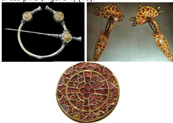
Figure 1. The examples of fibulae

A brooch is one of the most ancient adornments; its history is almost equal to the history of mankind. For the first time, the brooch analogue is found in the Bronze Age, more than 5 thousand years ago. At that time the brooch had a slightly different design and was called a fibula . Most often it was a round or oval metal product with two openings through which a thick pin passed, which fastened the brooch to the fabric. In the Bronze Age, the fibulae were common in Scandinavia, Hungary, Northern Germany, and later, in the Iron Age, – almost everywhere in Eurasia. In addition to the round fibulae, there were also ring-shaped fibulae, and also simple dress pins (Figure 1) [10].