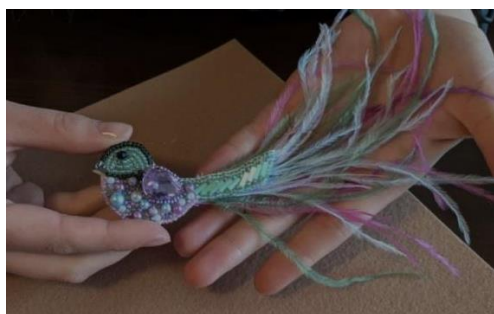
Figure 7. A sample of a finished bird-shaped brooch

more holes, through which they are sewn onto the fabric.