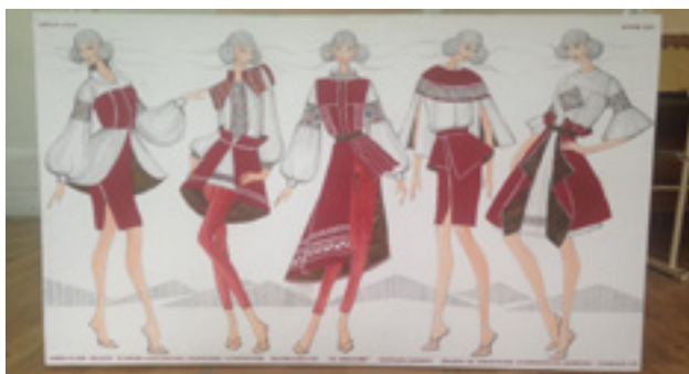
Figure 1 – The sketches of models of the collection Reflection based on Ukrainian ethnic clothes

Based on the conducted research, a promising collection of sets of clothes for youth has been developed, in which the principles of compositional construction of a folk costume with an emphasis on unique and intricate embroidery and morphological signs of the forecasted development of a form have been used (Fig. 1).