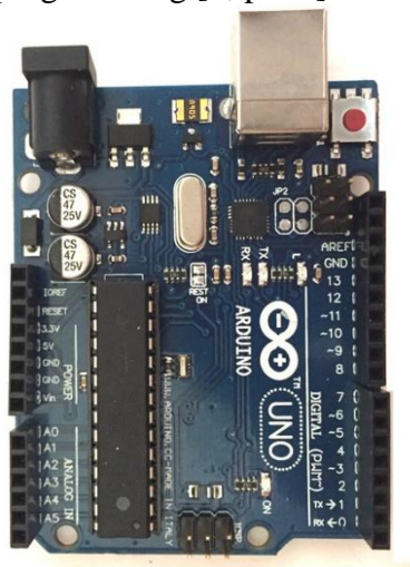
Fig. 1. Arduino Uno

"The Grabber" is a robotic arm developed by "Fischertechnik," designed to carry out tasks like object recognition, grasping, and object sorting. Moreover, this robotic arm can be effectively utilized in automating a wide range of production processes. The microcontrollers offered by "Fischertechnik" stand out in the market due to their prominence when compared to competitors. Nevertheless, alternative microcontrollers, such as Arduino, are also noteworthy, especially for those seeking to learn microcontroller programming [2, p. 13].