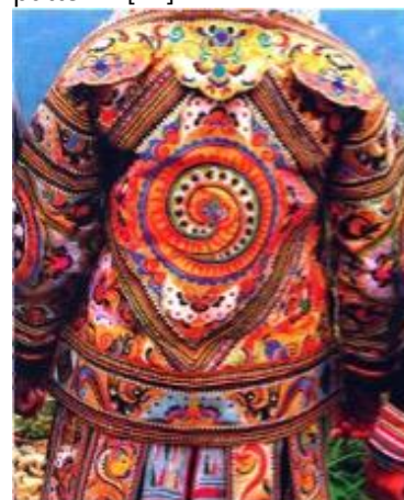
Fig. 8. Guizhou Qiandongnan Miao Hundred-Bird Garment [15]