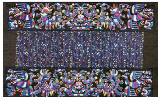
Fig. 4. Splicing and Continuous combination of multiple composite type [14]