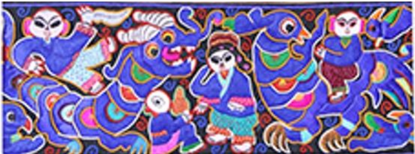
Fig. 1. Miao Embroidery "Bull Head with Dragon Body" Pattern [14]