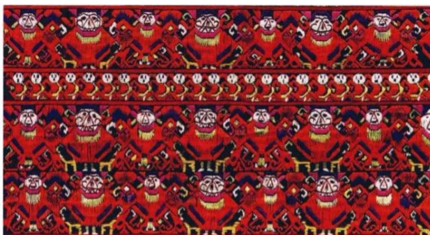
Fig. 3. Multi-segmented patterns repeated composition of continuous type [14]