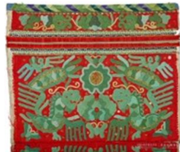
Fig. 2. Patterns segmented composition of splicing type [14]