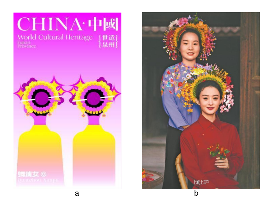
Fig.1. Hangzhou Asian games poster design: a – illustration poster design of Quanzhou, China; b – photo of Chinese celebrities wearing Zan Hua Hairpin

Hair" texture colors are chosen as the standard colors of the brand, imbues the logo with a heightened sense of regional and cultural identity.