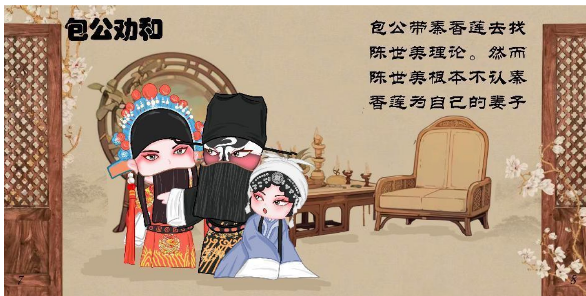
6Figure 3-7 Bao Gong urged peace