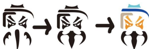
Figure 3-1 LOGO design process