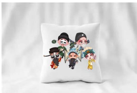
12Figure 3-13 Throw pillow design