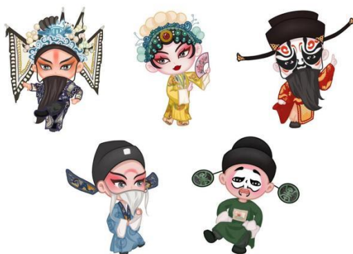
2Figure 3-3 IP image design