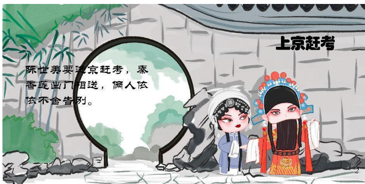
3Figure 3-4 Go to Beijing for the exam