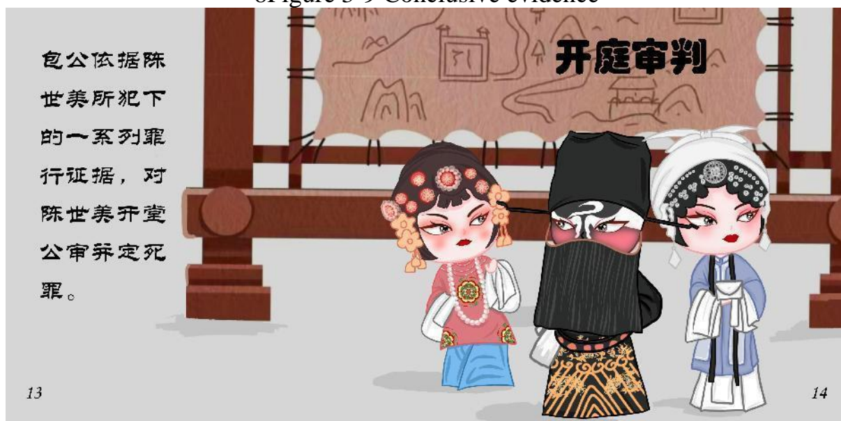
9Figure 3-10 Hold a trial