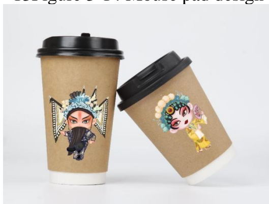
14Figure 3-15 Cup design