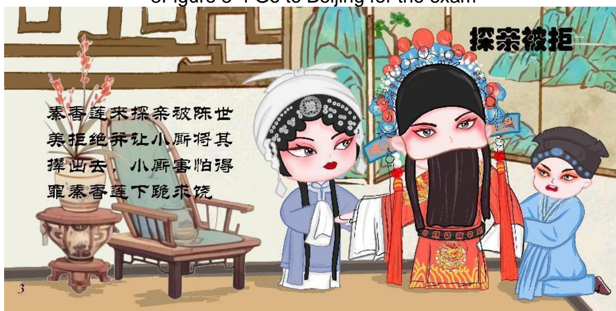
4Figure 3-5 Family visits were denied