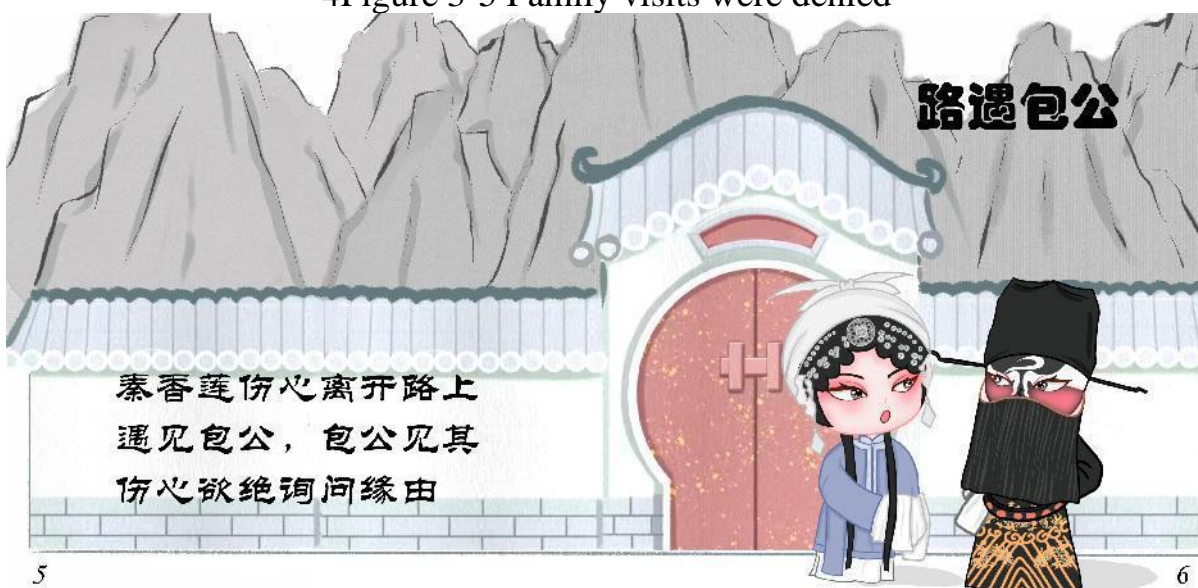
5Figure 3-6 The road met Bao Gong