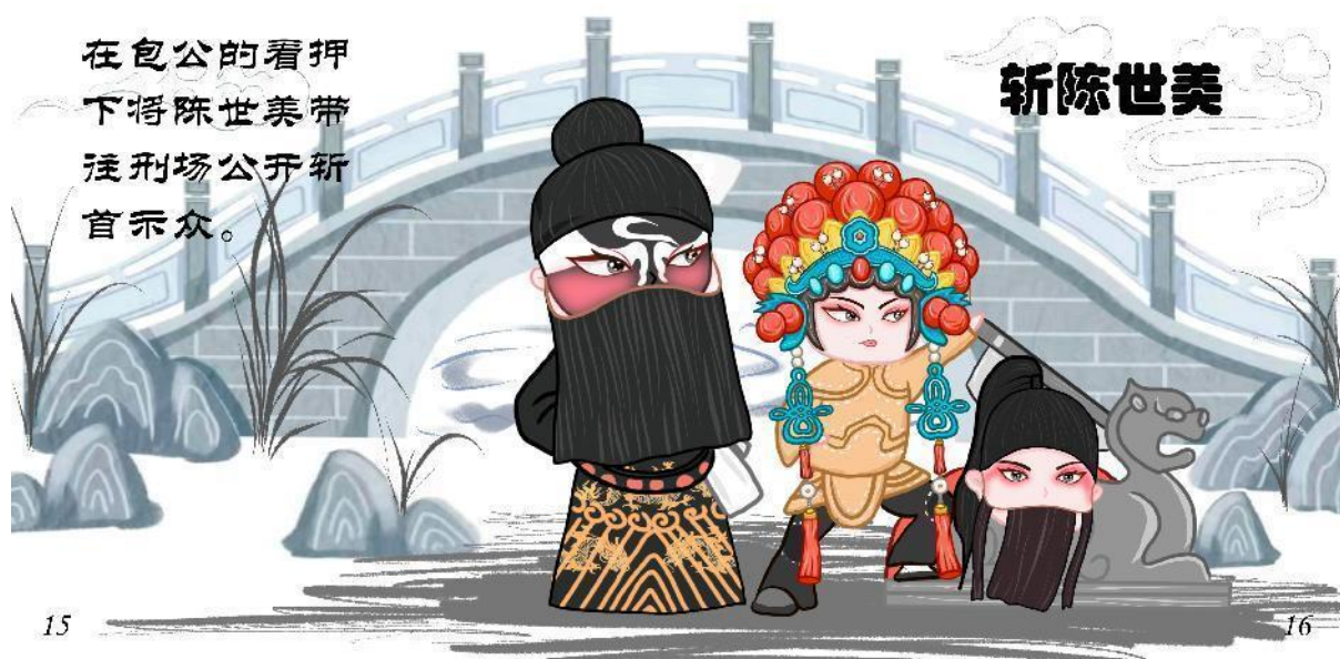
10Figure 3-11 Kill Chen Shimei