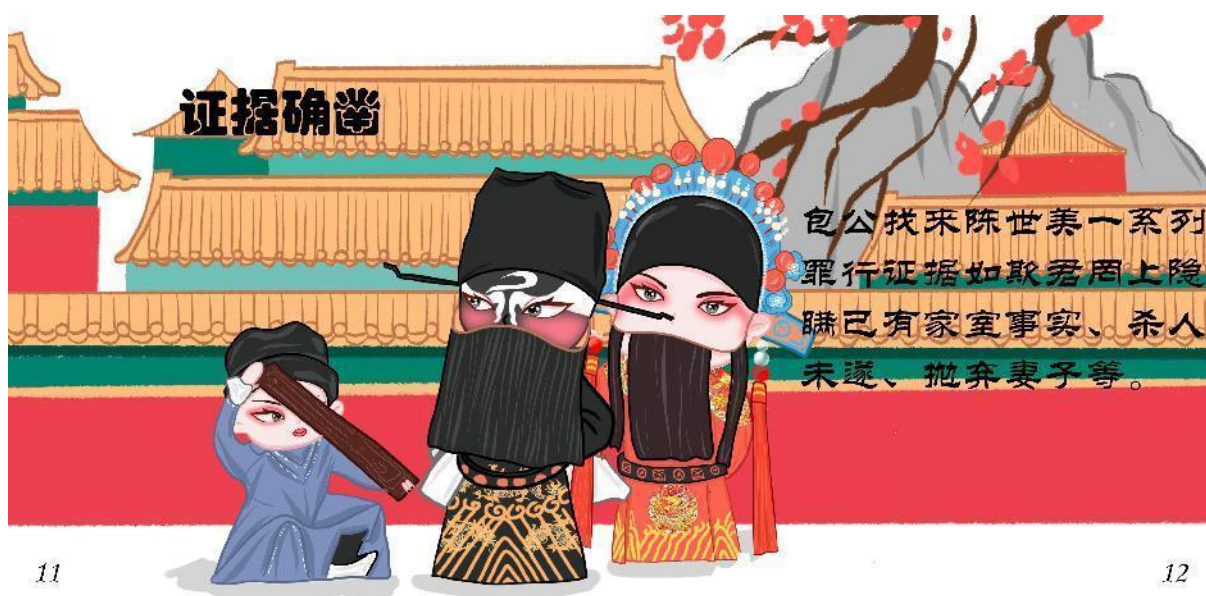
8Figure 3-9 Conclusive evidence