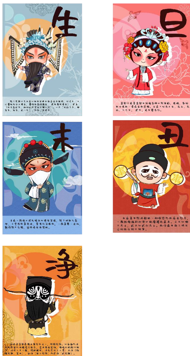
Figure 3-12 Poster design