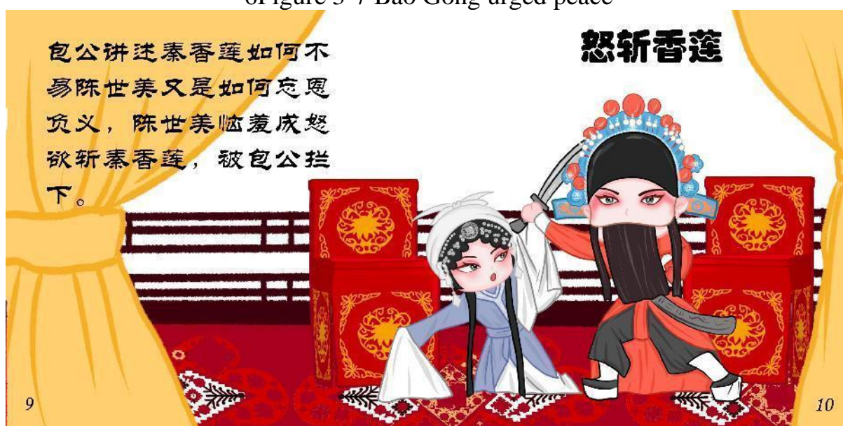
7Figure 3-8 Raging Slash Xiang Lian